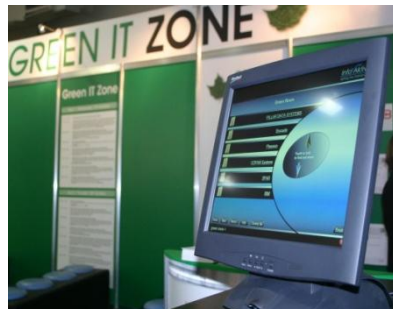
Counter-top system (also available in silver)